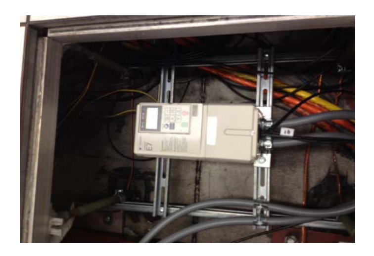
Figure 4. VSD installation: plain VSD mounted under the floor near the CRAC (Credit: Ritenour, 2012)