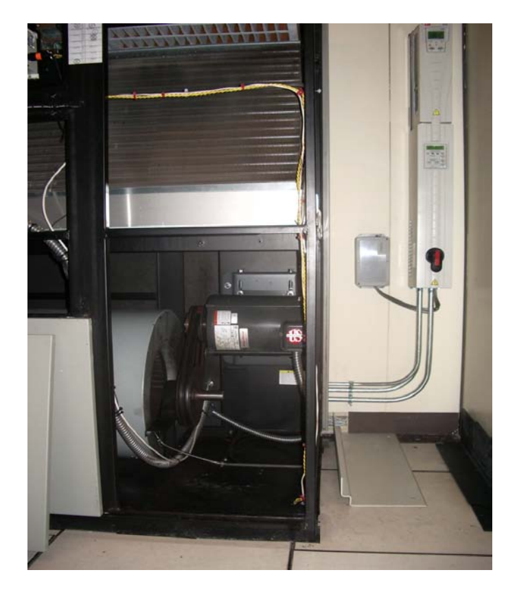
Figure 3. VSD installation: VSD with bypass mounted on wall near the CRAC (Credit: Symanski 2012).