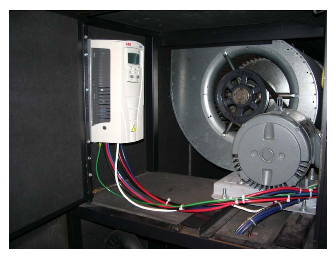
Figure 2. VSD installation: plain VSD mounted inside the CRAC.