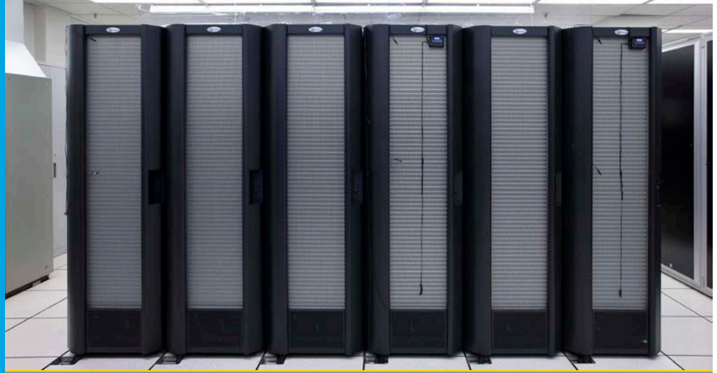
Figure 1: Passive Rear Door Heat Exchanger devices at LBNL

As data center energy densities in power-use per square foot increase, energy savings for cooling can be realized by incorporating liquid-cooling devices instead of increasing airflow volume. This is especially important in a data center with a typical under-floor cooling system. An airflow-capacity limit will eventually be reached that is constrained, in part, by under-floor dimensions and obstructions.