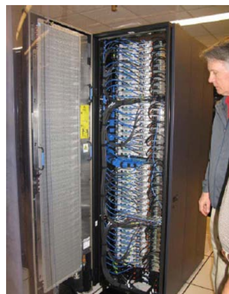
Figure 3: Inside rack RDHx, open 90°